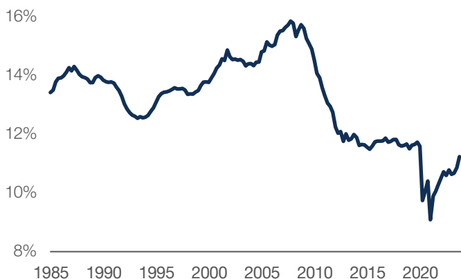
Figure 3. Household debt service ratio

Data as of December 31, 2024.