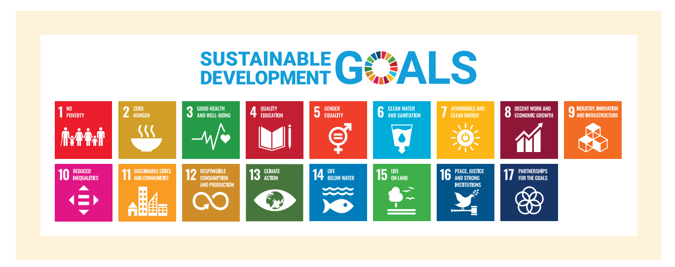
Figure 2: The Blueprint to Achieving a Better and More Sustainable Future for All<sup>6</sup>

Impact investing has made meaningful progress in taxonomy and measurement over the last three years. The 17 SDGs are increasingly being used in finance as a common language and taxonomy. Many impact investors are using these SDGs to describe qualitative goals and enhance comparability. At the end of 2019, 73% of impact investors used the SDGs for at least one measurement purpose—up from 60% over just the previous twelve months.<sup>7</sup>