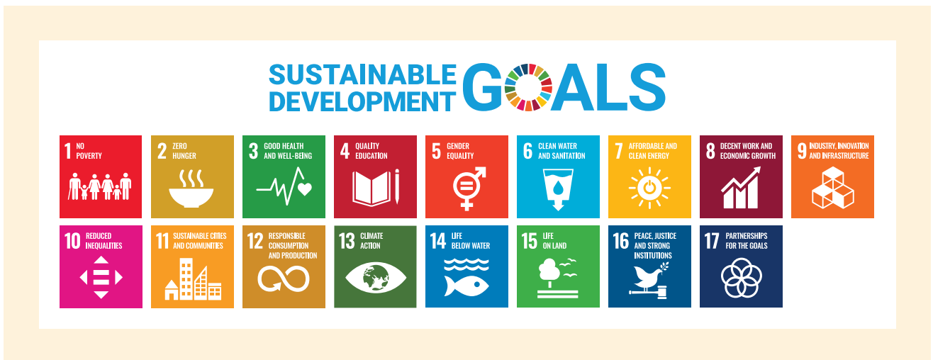
Figure 2: The Blueprint to Achieving a Better and More Sustainable Future for All 6

Impact investing has made meaningful progress in taxonomy and measurement over the last three years. The 17 SDGs are increasingly being used in finance as a common language and taxonomy. Many impact investors are using these SDGs to describe qualitative goals and enhance comparability. At the end of 2019, 73% of impact investors used the SDGs for at least one measurement purpose—up from 60% over just the previous twelve months. 7